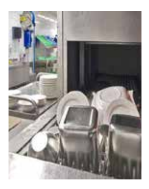
Dishwasher scale is reduced significantly and dishware is now spot-free.