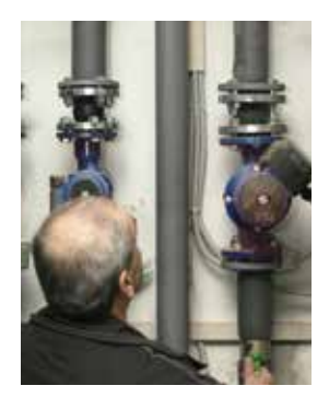
Piping systems remain clean and old scale deposits are gently reduced.

Grease traps have reduced odors and more consistent, less cluttering grease.