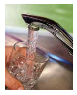
Faster cleaning of kitchen and bathrooms. Considerable savings in cleaning agents.