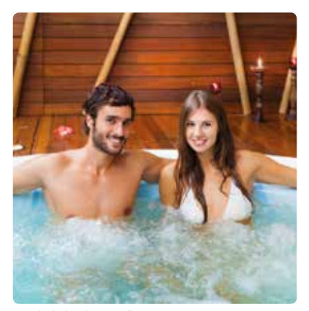
Hotel whirlpool in a wellness area

Pools are half-open loop systems which suffer constant water loss as the pool water evaporates. The water demands constant maintenance and chemicals need to be added to keep bacteria, algae, and air quality in compliance with standards. Vulcan improves the water quality and with this the effectiveness of certain substances. Vulcan reduces the cleaning effort for the pool itself, the water line, for tiles, grids, floors and walls.