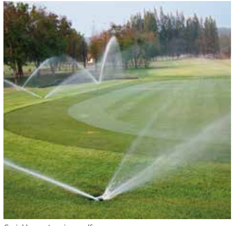
Sprinkler system in a golf course