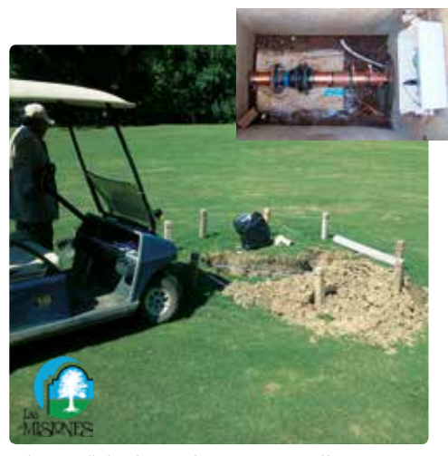
Vulcan installed underground at Las Misiones Golf Course